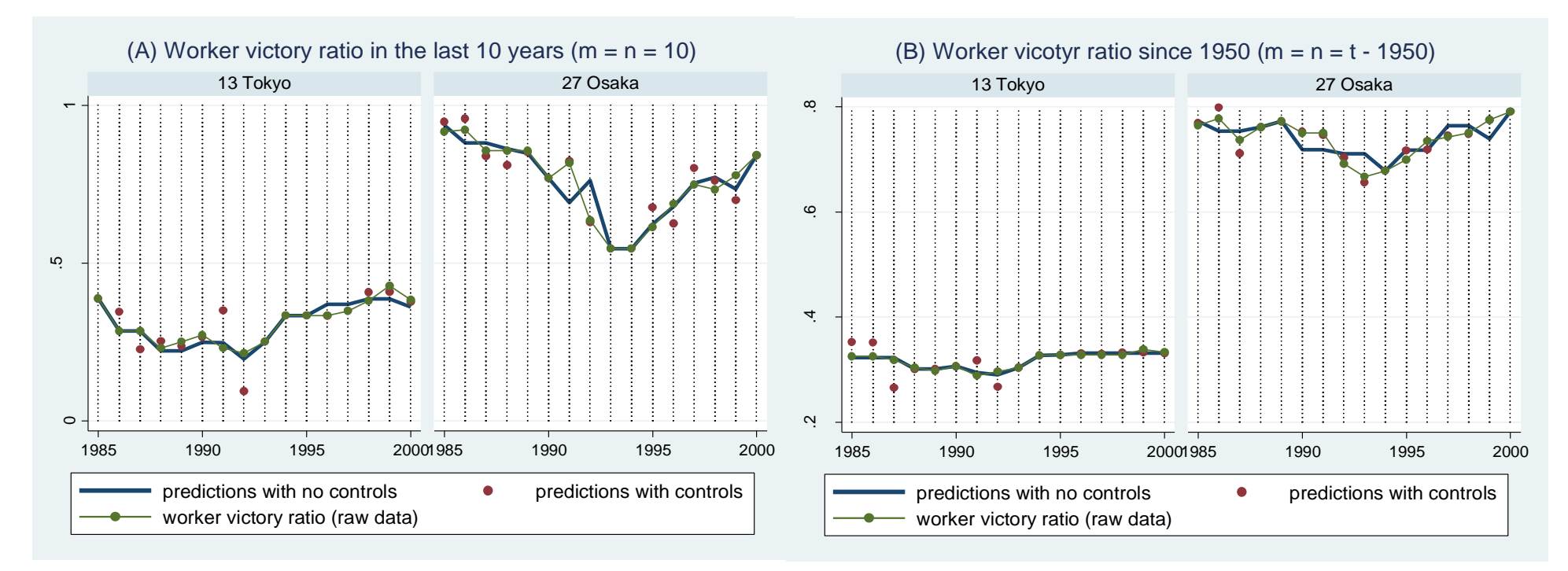
Figure 2. First-stage Predictions

Note . Blue lines indicate first-stage linear predictions without prefecture and year dummies (thus, including only judge effects and a constant). Red dots indicate first-stage linear predictions with prefecture and year dummies along with judge effects. Connected green dots are the actual worker victory ratios. In the main IV analysis, predicted values in red dots are used in the second stage estimation. The data are for the fourty-seven prefectures for the period 1985-2000. Number of observations is 752 in all specifications.