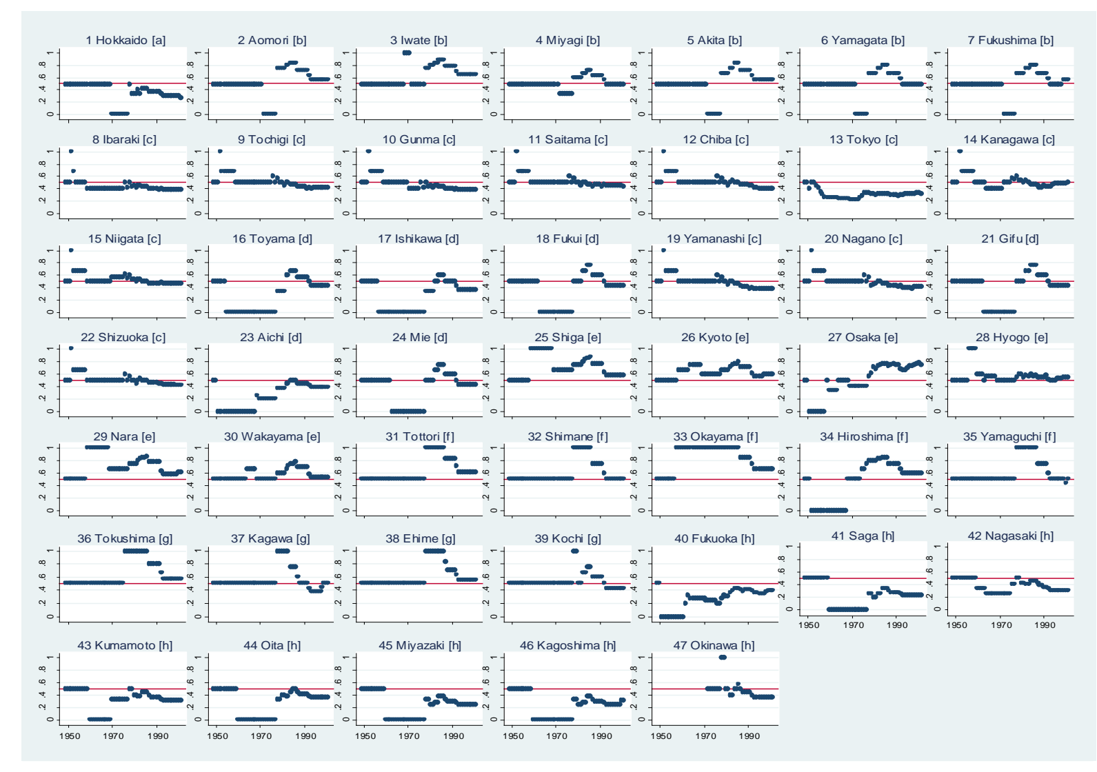
Figure 1. Worker Victory Ratio since 1950 (m = t - 1950)

Note . Figures present accumulated worker victory ratio since 1950 for each prefecture. [] denotes High Court jurisdiction; [a] under Hokkaido (Sapporo) H.C., [b] under Miyagi (Sendai) H.C., [c] under Tokyo H.C., [d] under Aichi (Nagoya) H.C., [e] under Osaka H.C., [f] under Hiroshima H.C., [g] under Kagawa (Takamatsu) H.C., and [h] under Fukuoka H.C. Litigation records are concentrated in Tokyo (No.13) and Osaka (No.27) maninly, consinsting 48 % of the total cases.